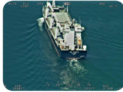
Video interface with onboard cameras